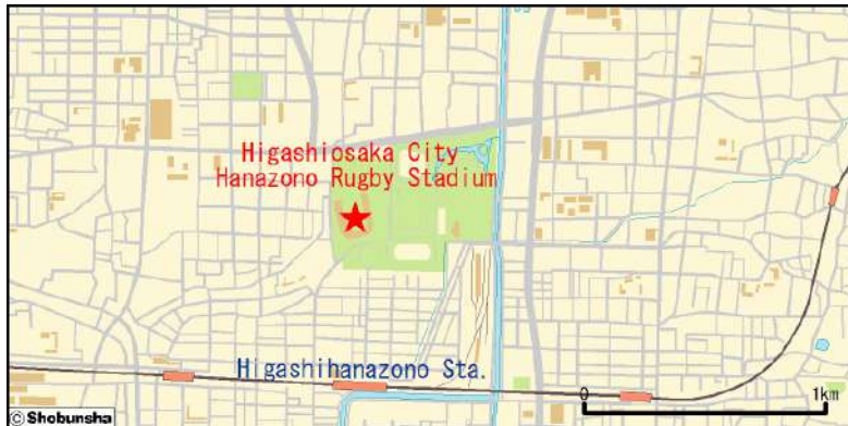
■ Higashiosaka City Hanazono Rugby Stadium