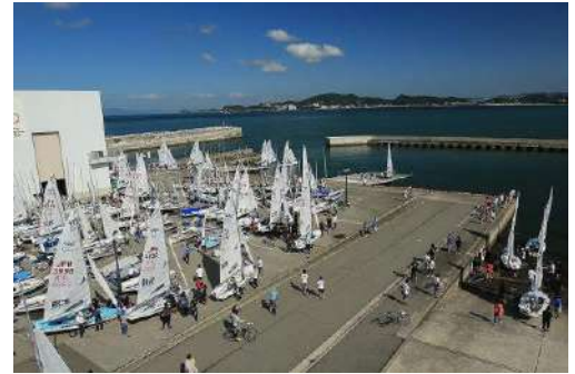
■ Wakayama Sailing Center