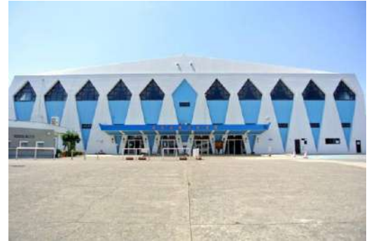
■ Wakayama Prefectural Gymnasium